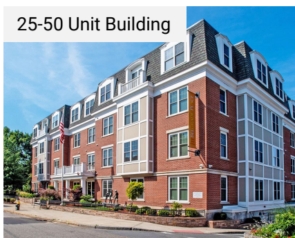
25-50 Unit Building