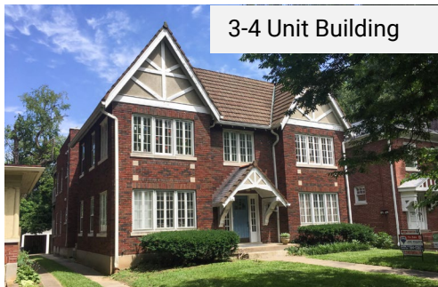
3-4 Unit Building

After drawing your district boundaries on the map, use this worksheet to indicate which housing typologies you feel are most appropriate for the districts you chose. Check the box next to your district name to indicate which housing type you would like to see. Keep in mind that MBTA Communities defines multifamily housing as a building with 3 or more units.