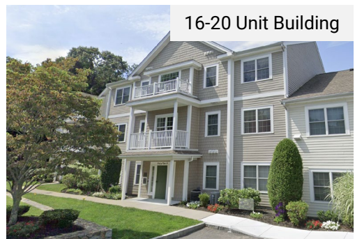
16-20 Unit Building