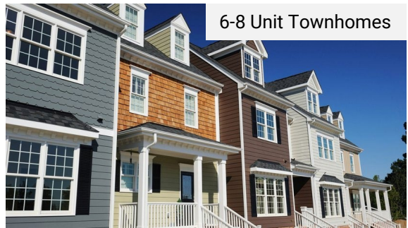
6-8 Unit Townhomes