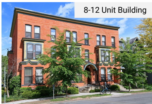
8-12 Unit Building